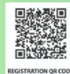
REGISTRATION QR CODE

https://apccedu.ap.gov.in/apcce/views/userlogin.aspx